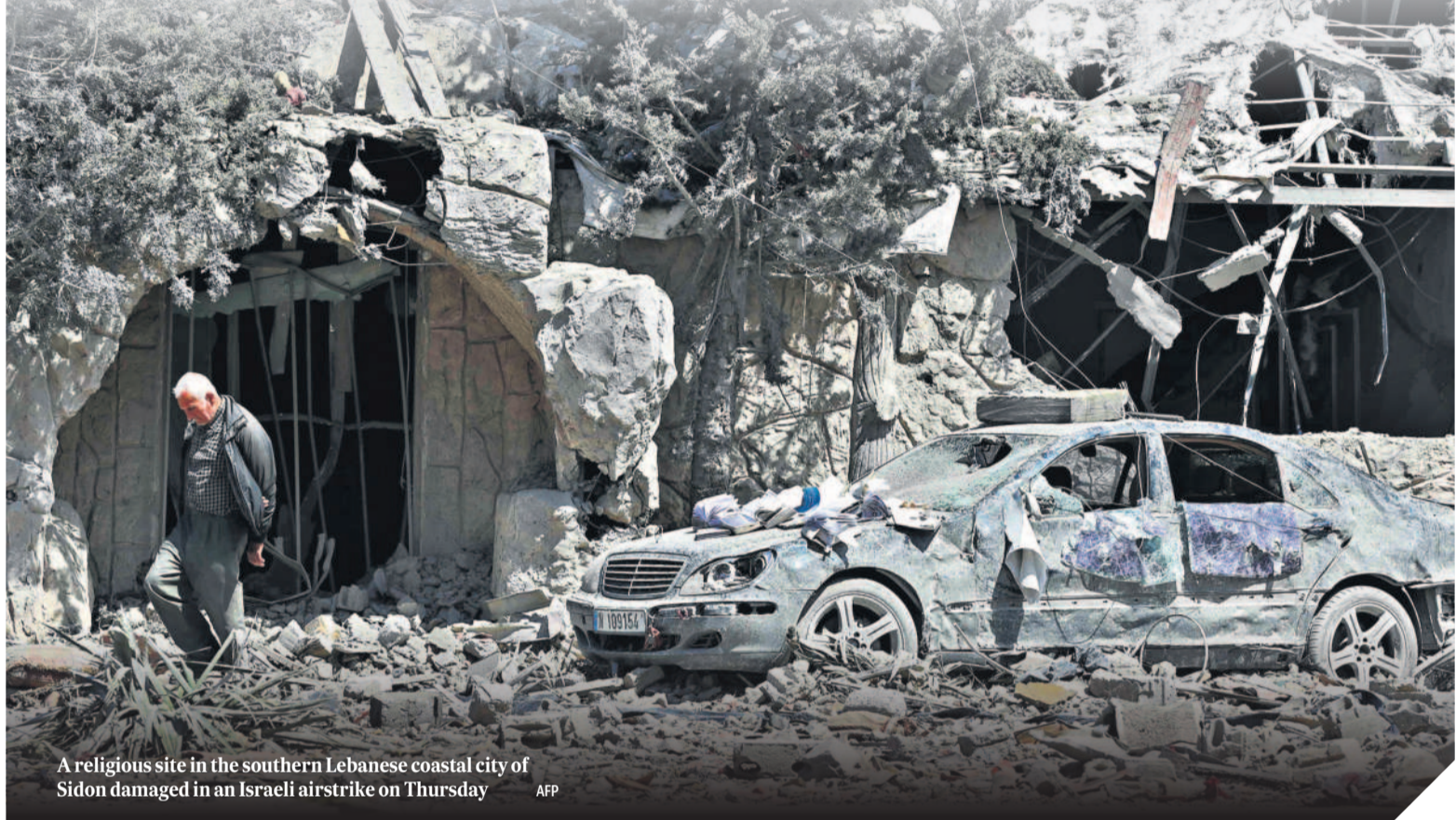
A religious site in the southern Lebanese coastal city of Sidon damaged in an Israeli airstrike on Thursday

CEASEFIRE TEETERS IN FACE OF DISAGREEMENTS OVER LEBANON AND HORMUZ >P3