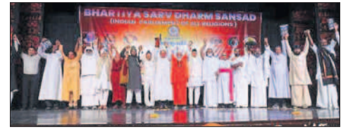
The celebration left everyone inspired with the message of unity, love, and peaceful coexistence

The event featured the release of the school's annual magazine, Agnel