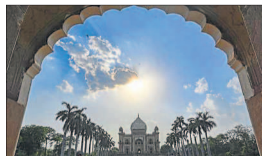
The Safdarjung Tomb in New Delhi on Thursday. The mercury inched up after several days

Weather experts said temperatures are now expected to rise steadily. "We are expecting a