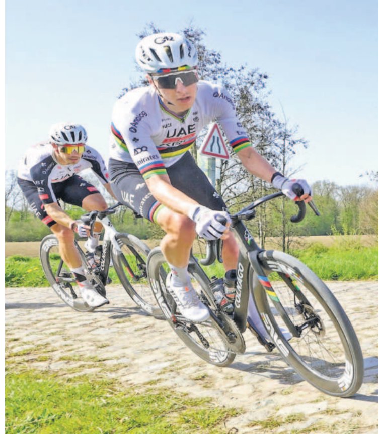
UAE Emirates-XRG's Slovenian rider Tadej Pogacar (R) rides with his team over the cobblestones of the 'trench' of Brillion in France.