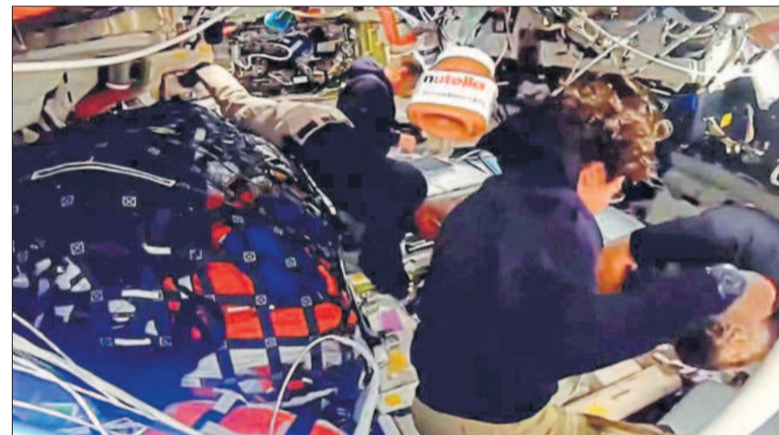
This screengrab from a Nasa livestream shows a jar of Nutella floating aboard the Orion spacecraft as Artemis II crew members Victor Glover, Reid Wiseman, Jeremy Hansen and Christina Koch work on Monday.

Carney was referring to a viral image of a jar of nutella floating through the Orion space capsule, and his question had the crew in fits of laughter. "I'll take that as a yes," Carney said, also extending an invitation to visit Ottawa, the Canadian capital. "Don't look too closely right now," the Prime Minister added. "You'll notice that it's still pretty white, but the snow is going to go."