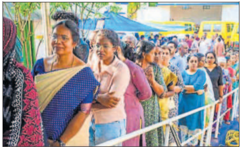
People queue up at a polling station in Thiruvananthapuram on Thursday

In Assam, more than 2.5 crore electors are eligible to exercise their franchise for the 126-member legislative Assembly. There are 722 candidates in the fray. Of 2,50,54,463 electors, 1,25,31,552 are male voters and 1,25,22,593 females. There are 318 Transgender voters and 63,423 service voters. To strengthen the monitoring mechanism, webcasting facilities have been arranged in accordance with the Commission's directions, a release said. Webcasting has been enabled in all 31,490 polling stations, including 31,486 main polling stations and four auxiliary polling stations. A total of 1,51,132 polling personnel have been deployed for the conduct of the election.