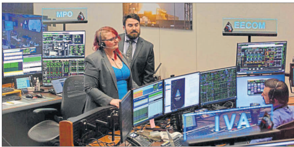
Flight controllers monitor the Artemis II Orion spacecraft from the White Flight Control Room at the Nasa Johnson Space Center in Houston, Texas, on Wednesday

Glover and fellow Nasa astronauts Reid Wiseman and Christina Koch, and Canadian astronaut Jeremy Hansen are the first wave of astronauts in a multibillion-dollar series of missions