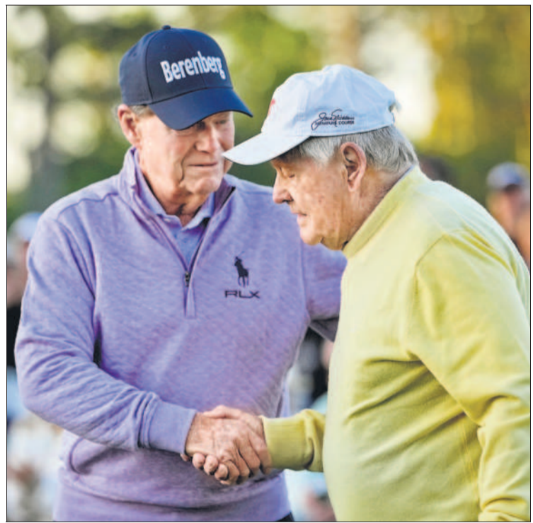
Jack Nicklaus is greeted by Tom Watson during the ceremonial tee shot.

World No.2 McIlroy arrived this week without carrying the burden of having never won a Masters after he beat Justin Rose in a playoff last year to become the sixth man to complete the career Grand Slam of golf's four majors. "I know that I can do it now, so that should make it a little easier for me to go out and play the golf I want to play," McIlroy, whose best finish in four starts this season was a share of second at Riviera in February,