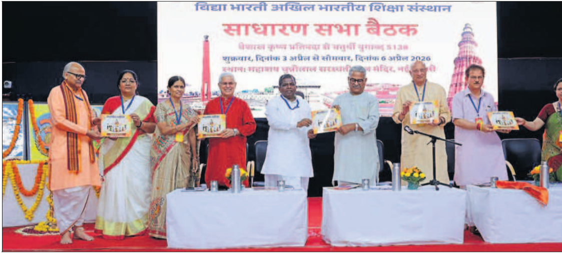
During the session, a 'Smarika' (commemorative publication) based on the theme 'Saptashakti Sangam' was also released