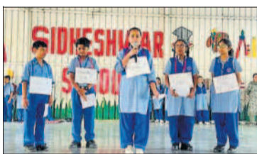
The event was organised to emphasise the importance of physical and mental well-being among students

The students of Class 6 presented a captivating skit and delivered an insightful speech, highlighting the significance of a healthy lifestyle. In addition, the programme also included a session of yoga exercises,