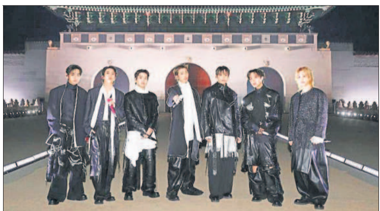
BTS members (from L to R) V, Jin, Suga, RM, Jungkook, J-Hope and Jimin pose before their concert at Gwanghwamun Square in Seoul on March 21, 2026.

BTS — short for Bangtan Sonyeondan, or Bulletproof Boy Scouts in Korean — debuted in June 2013. The seven-member group launched in 2013 with the hip-hop heavy single album 2 Cool 4 Skool, releasing three full-length projects before really gaining momentum with their 2016 album Wings.