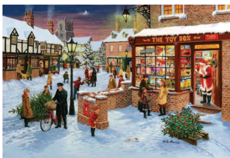
Answer: 1. The Toy Box 2. Yes 3. Santa Claus 4. Yes, a cycle 5. No