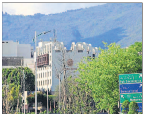
A view of the Serena Hotel with the Margala Hills, as Pakistan gears up to host the US and Iran for peace talks, in Islamabad, on Thursday

Trump said Wednesday that the US would work with Iran to remove the buried uranium, though Iran did not confirm that. In one version of the deal that Iran published, it said it would be allowed to continue enrichment.