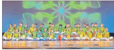
A major highlight of the event was a theatrical presentation titled 'The Land of Oz', which transported the audience to a magical world

NOIDA: Pragyan School, Greater Noida, celebrated the Annual Day of Classes 3-5 titled 'Concord', in its auditorium with enthusiasm. The morning began with an exhibition of students' work in the auditorium foyer. Parents and guests had the opportunity to admire a wide range of creative projects, artwork and academic displays prepared by students. The cultural programme com-