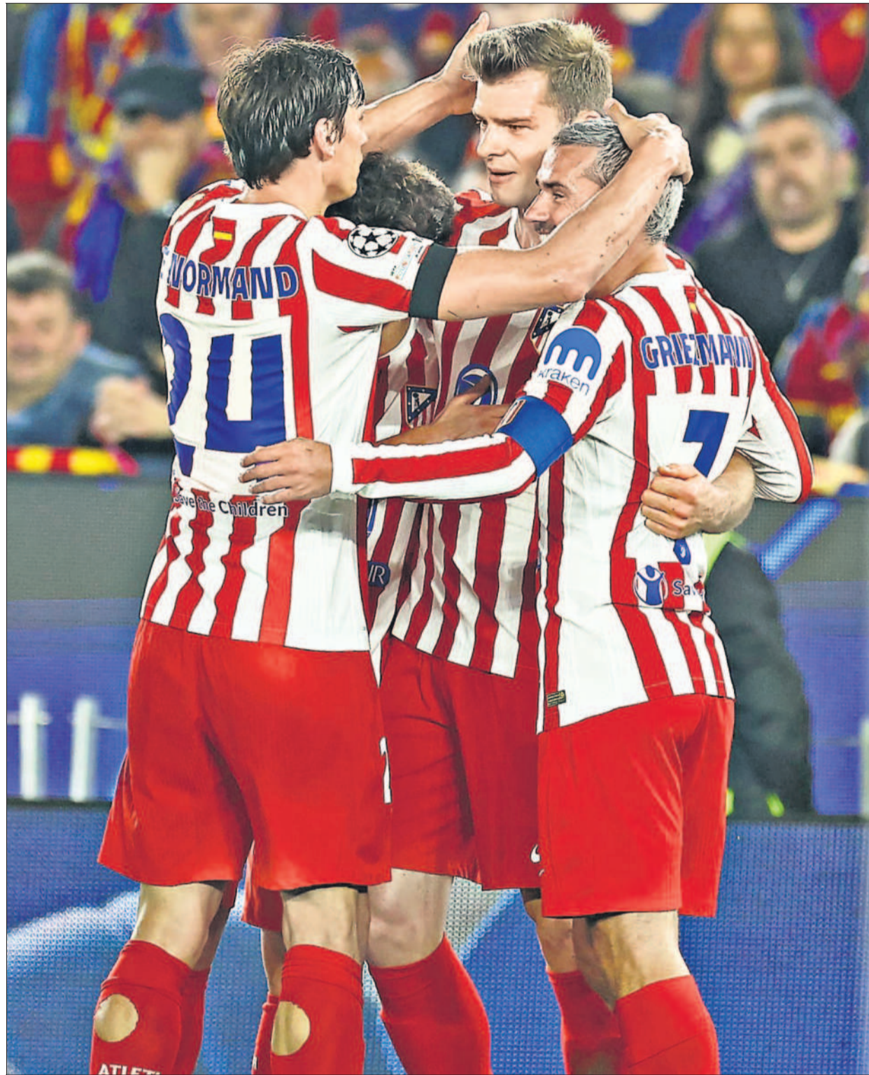
Atletico Madrid players celebrate their second goal against Barcelona at Camp Nou in Barcelona on Wednesday.

PARIS: Desire Doue and Khvicha Kvaratskhelia scored the goals to give a dominant Paris Saint-Germain a 2-0 win over Liverpool in their Champions League quarter-final first leg on